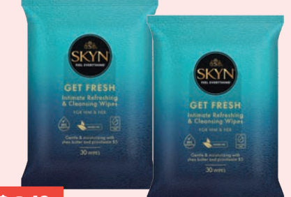
$ 6 <sup>49</sup>