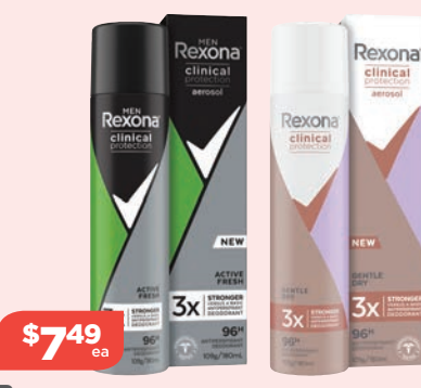
Skyn Get Fresh Wipes 30 Pack

Rexona Clinical Protection Aerosol Deodorant 109g/180mL (Variants)