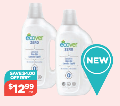
Dentagenie Interdental Brushes 12 Pack (Variants)

ECover Zero Non-Bio Laundry Liquid 1.5 Litre